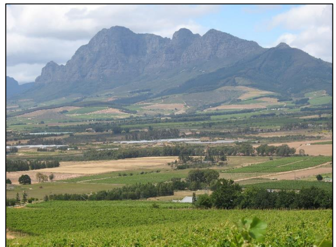
Figure 2. Agroforestry in South Africa is often dominated by eucalypts and even Mediterranean pines ( Pinus pinaster ), where cultivated lands (here viticulture) are surrounded by forested areas of different sizes.

In agroforestry systems the requirement of fast growth is slightly less important than in SRC systems and this allows a greater diversity of trees and the non-woody components. This is particularly important regarding the functions of agroforestry and the possibilities to create new habitats and maintain or increase the biodiversity of agroecosystems. Using indigenous trees with high-value products in agroforestry systems enhances profitability, particularly those that can be marketed as ingredients of several finished products. In certain countries, the use of indigenous tree species is difficult, since their growth is far behind the growth of some exotic genera, such as Eucalyptus , which is extensively planted in Southern Europe and South Africa (Figure 2).