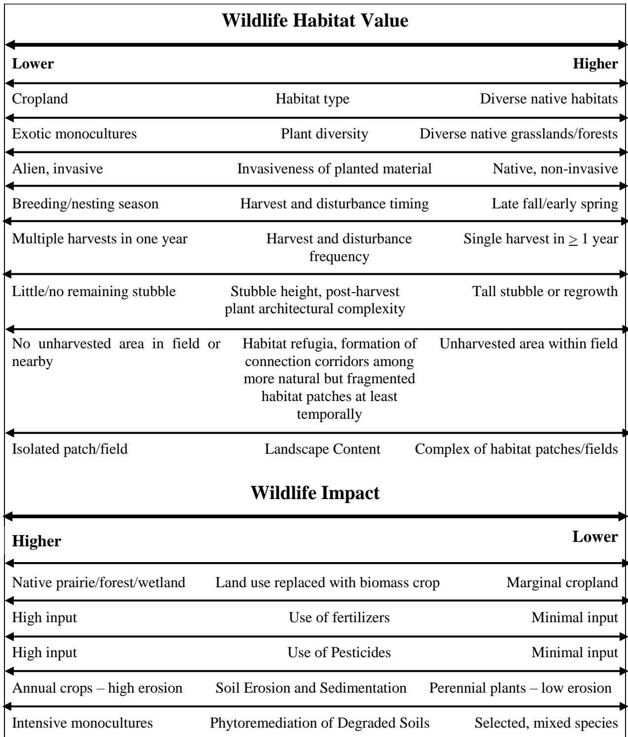
Figure 4. The value of wildlife habitats depending on the cultivation factors of bioenergy crops. For each factor, the qualities associated with greater wildlife benefit (or less impact) are listed on the right side of the figure, and the qualities that are associated with less wildlife benefit (or greater impact) are listed on the left side of the figure. The degree of plant architectural complexity: if higher, the habitat contains more strata, more and diverse branches, the wildlife is characterized by more microhabitats with higher chance for niche segregation, and more species; lower complexity results in habitats with simple layer, linear structures of wildlife, fewer microhabitats, and niches for fewer species